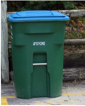
96 gallon tote, commonly used for compost collection