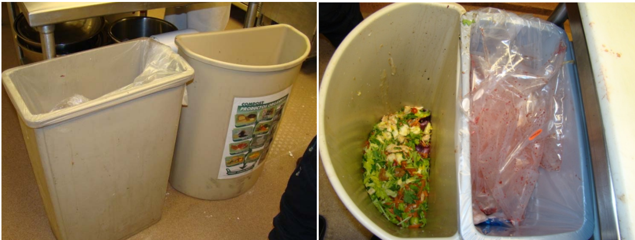
Trash and compost bins at Bumps restaurant, winter 2011.