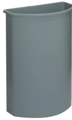
21 gallon half round trash can, used for inside collection