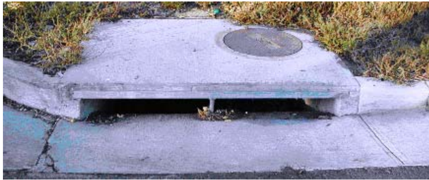
Figure 4.10.b Curb Opening Inlet

Referring to the Example for Design Flow above, the design flow on the street has: Q_s = 11.7 cfs, Q_w = 6.43 cfs and Q_x = 5.32 cfs. The curb opening inlet in Figure 4.10.b has a length of 5 feet and open height of 4 inches. Considering a clogging factor of 0.12 for a single unit, determine the interception rate for 4 units of curb-opening inlet.